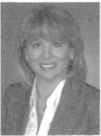
DIANNE WATTS MAYOR